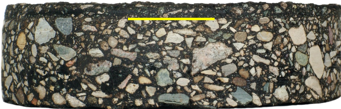
Typical Surface Treatment 3/16" - 3/8" Over existing asphalt pavement