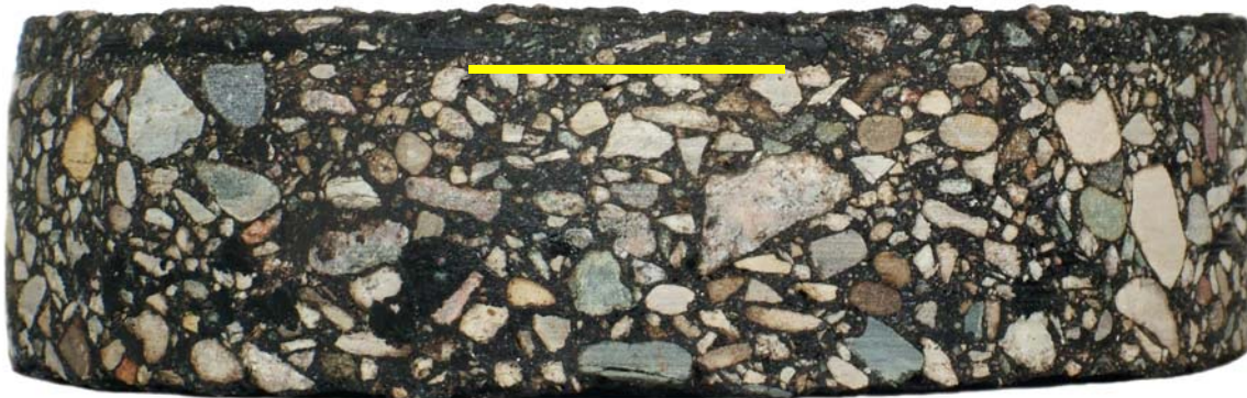
Typical Surface Treatment 3/16" - 3/8" Over existing asphalt pavement