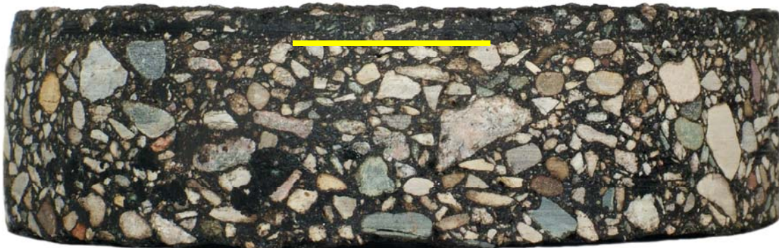
Typical Surface Treatment 3/16" - 3/8" Over existing asphalt pavement