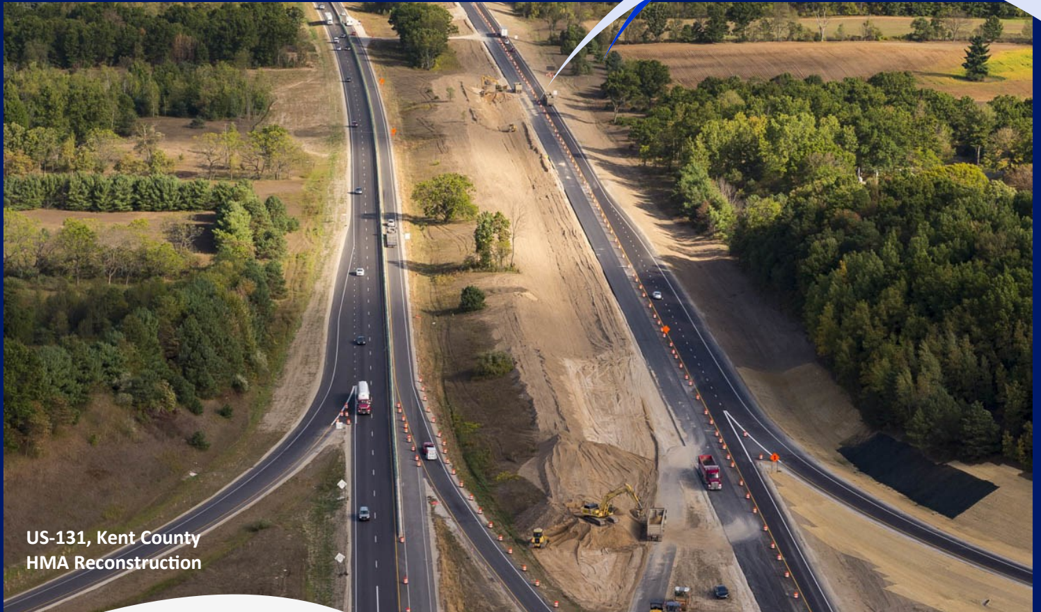
US-131, Kent County HMA Reconstruction